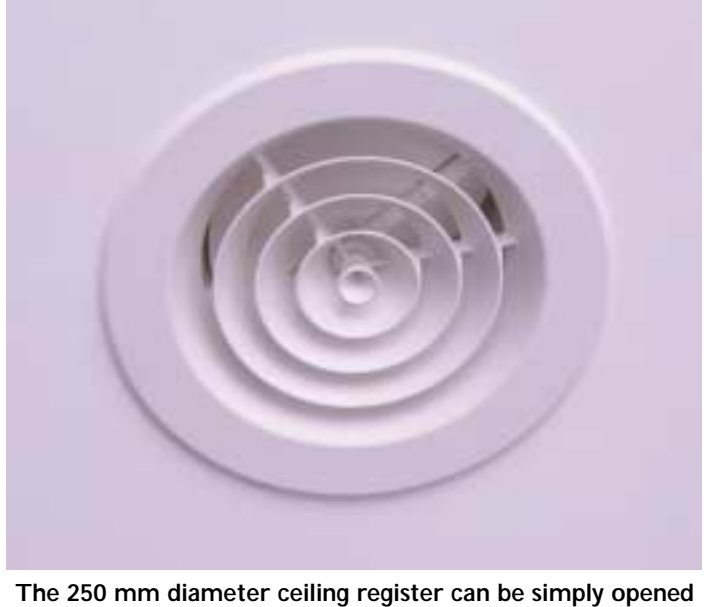
The 250 mm diameter ceiling register can be simply opened and closed to suit conditions.